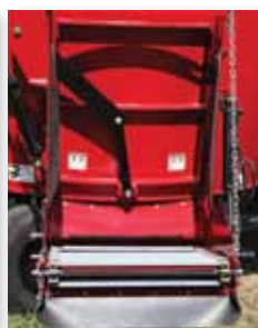
Rotatable tub set for right hand discharge w/optional conveyor.