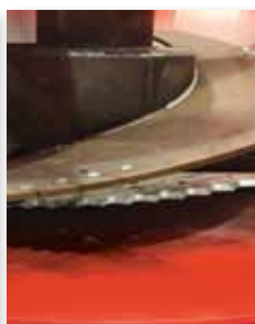
Optional aggressive knife.