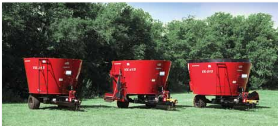
VX Series models: 315, 415 and 515

Most skid-steer loaders can easily load rations into the new Roto-Mix VX series mixers because of their Low-Profile design.