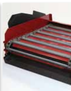
Conveyors available in optional lengths 24", 36" and 48".