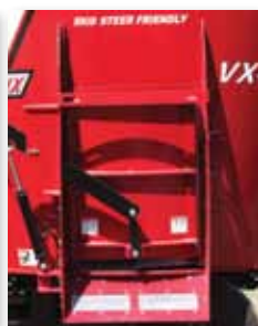
Rotatable tub set for left hand discharge with magnet.