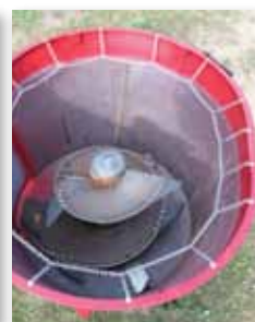
Retention chain option.