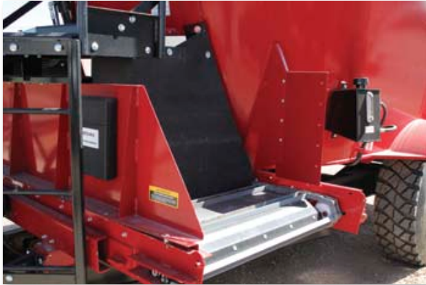
Side Discharge or Front Center Flat Sliding Conveyor Feeds Out of Either Side - Optional Fixed or Adjustable Incline Conveyors to match your feeding needs.