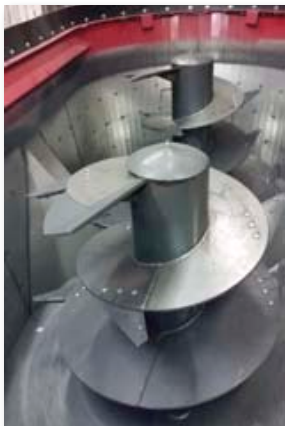
Twin Matching Single Flighted Augers with Several Knife Options available for faster mixing and processing of long fiber material.