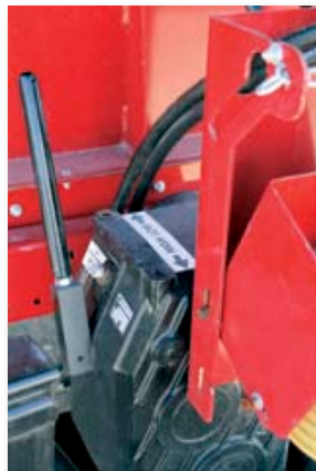
Two speed PTO driven gearbox for slow speed mixing and high RPM for better cleanout. Optional hydraulic shifter allows shifting from the cab of the tractor.